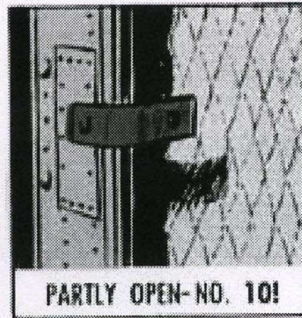
PARTLY OPEN-NO. 10!