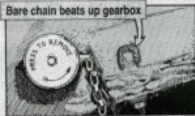
Bare chain beats up gearbox

Solve the problem by sleeving the chain with shrink tubing. NSN 5970-00-812-2967 brings a foot of 1/8-in tubing; NSN 5970-01-169-1723 brings a foot of 3/8-in tubing.