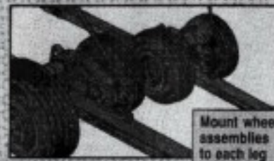
Mount wheel assemblies to each leg

When you've installed the eye bolts, simply mount your Cobra wheels to each leg of the tow bar.