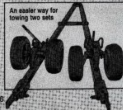
An easier way for towing two sets

2. Or you can modify the tow bar, itself, to hold two sets of wheels.