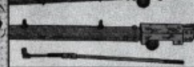
Remove wheel housing to install eyebolts

To fasten the eye bolts to nuts inside each leg, place the nut in the appropriate size socket, attach the socket to a socket wrench and attach the wrench to a breaker bar. The whole thing's got to be at least 30 inches long to reach the holes. Then thread each bolt through the hole into the nut and tighten.